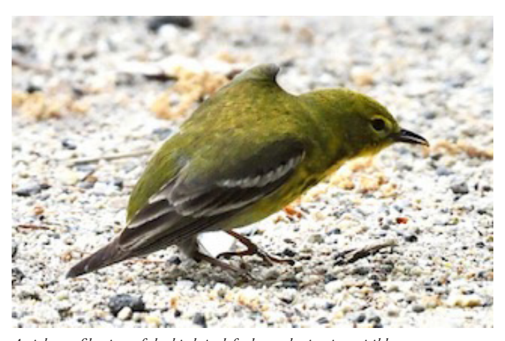
A right profile view of the bird, its left elevated wing just visible.