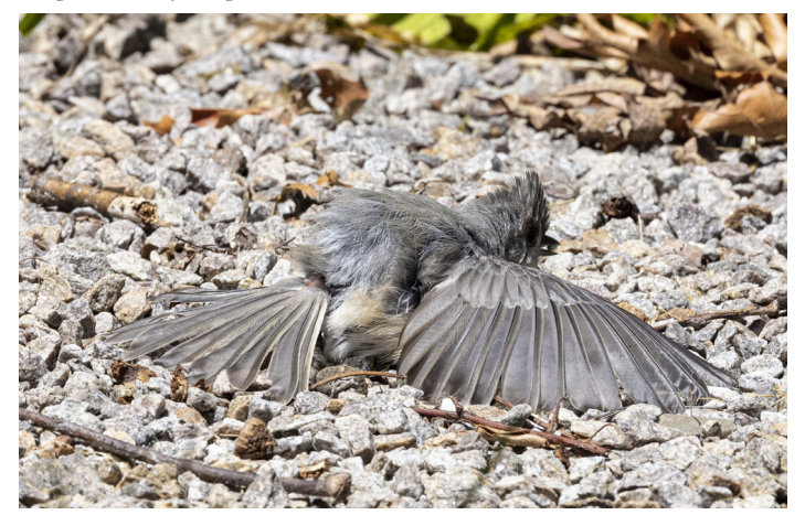
"Wait. No. I'm still alive!" This bird perks up a little bit after a few minutes of face down sunbathing.

some hot stones and spread eagle on its belly. Like a crash landing, it was all very fast. At first, I thought it had died right in front of me as it remained motionless, but after a minute it got up and flew away without any difficulty. The same bird or others did the same thing several times over the next 10 minutes. I had never seen this before, so I searched the internet and found it is known behavior that has a variety of possible reasons ranging from getting mites out of their feathers to getting some sunshine vitamin D by exposing the oil gland at the base of their tail.