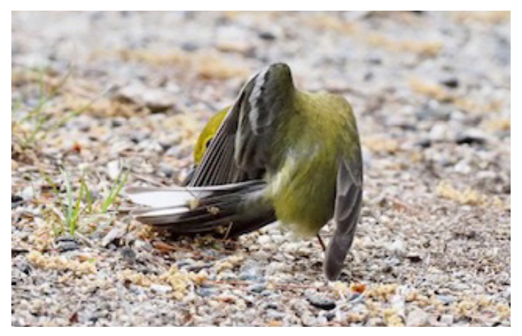
An acrobatic view of this Pine Warbler from behind, seen here now rubbing the ant on its wing feathers.

marsh to a small pond and a few acres of mixed forest. Early morning on May 27 as I walked the road, I noticed a Pine Warbler hopping along just in front of me. At first, I thought it might be foraging for insects, but as I watched it, I noticed that it picked something up and then was all aflutter and appeared to be rubbing it under its wings and on its