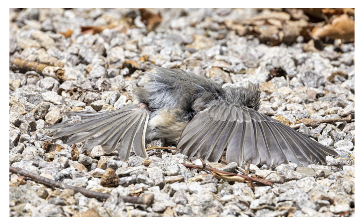
"That's it. I'm done for. Goodbye world." The preen gland is clearly visible in this prostrate Tufted's posture.