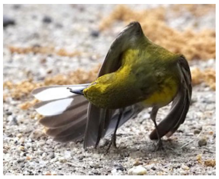
This Pine Warbler is actively "anting" by applying the ant in its beak to the tail feathers.

Part of the rush of spring migration is the great looks at flocks of warblers in low trees and bushes as they touch down before moving on. Typically, I get a few great photos of Pine Warblers in April and May and then spend the rest of the summer listening to them trilling high in the treetops and rarely getting a glimpse of them. That's why this bird surprised me. I was walking in the city park, which has a nice mix of habitats from brushy powerlines to an extensive