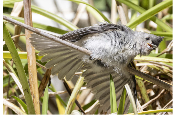
"Help me, I'm melting..." A Tufted Titmouse finds a low perch in the sun. By its position and expression, you can imagine its words.